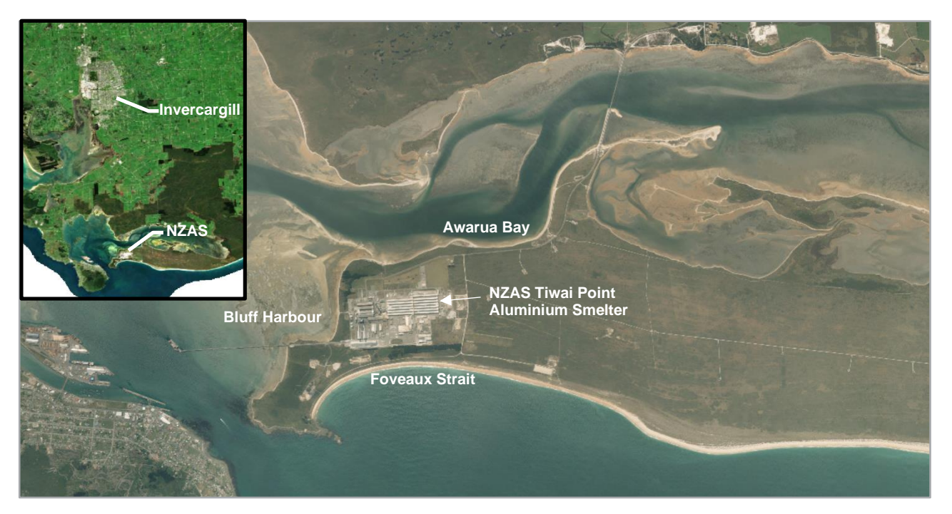
Figure 1: NZAS location

NZAS uses the Hall-Héroult process to reduce alumina to aluminium metal. NZAS has four reduction lines. Potlines 1 and 2 were commissioned in the 1970s and Potline 3 was commissioned in the early 1980s. Potline 4 was commissioned in 1995. A wharf and ship unloader are located to the west of the smelter site and are used for unloading alumina and coke. Pitch and heavy fuel oil (HFO) are imported to site via pipelines from the wharf to site. Alumina, coke, liquid pitch and HFO are stored on site in sheds and tanks. Carbon anodes are formed in the green carbon paste plant. These are then baked in oil-fired ovens (carbon bake furnaces) to improve physical and electrical properties. There are two operating carbon bake furnace buildings. Used anodes (butts), are crushed and used in the production of new anodes, along with petroleum coke and liquid pitch. Aluminium ingots are cast in the metal products area. There are two vertical direct chill casting machines for producing value-added alloys in the form of billets and blocks. Each casting line has associated molten metal holding furnaces.