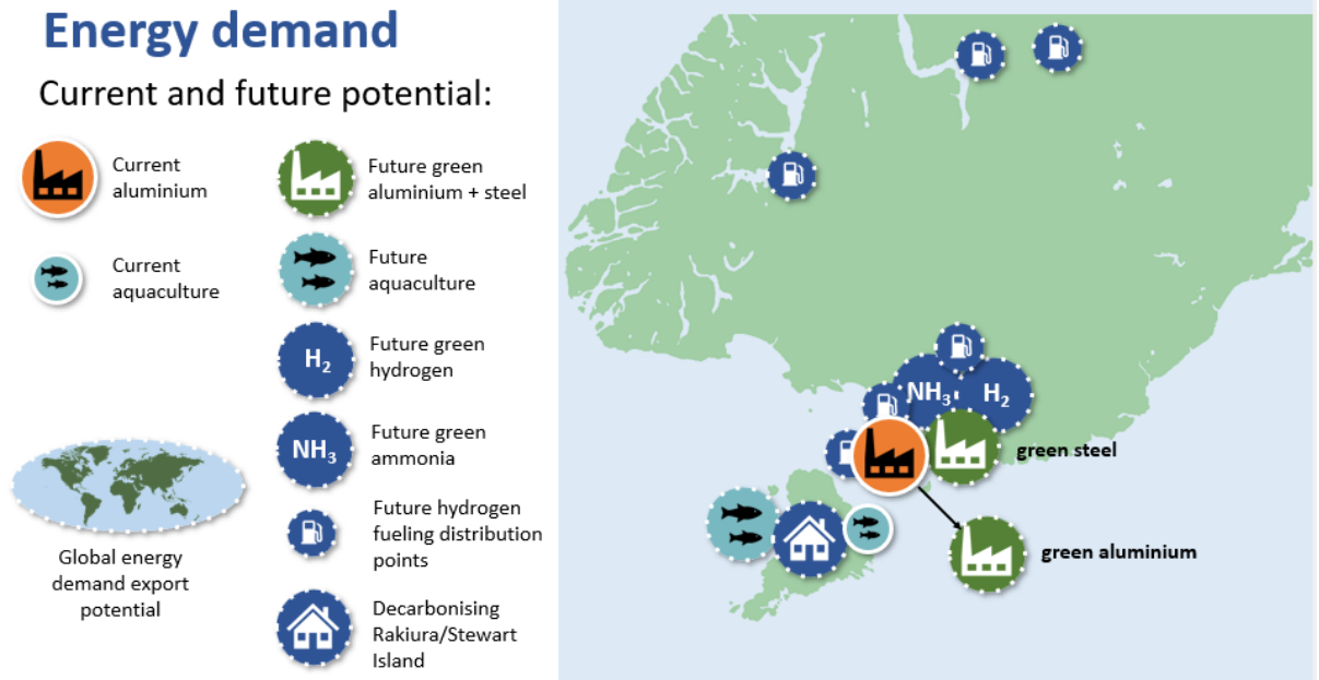
Figure 2: Current and Future Demand Projects; Source: Murihiku Regeneration Energy Transition Plan, 2023